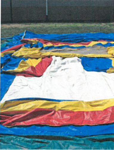
Step 1: Fold material neatly towards middle.