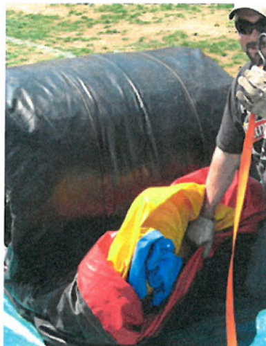
Step 7: Tuck in rope or strap 2-3 feet underneath Inflatable before roll is complete.