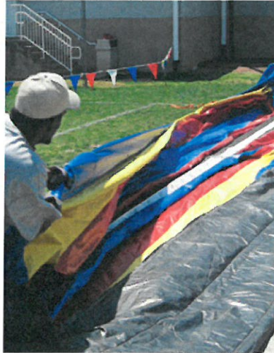
Step 2-6: Fold the Inflatable in 2-3 feet lengthwise.