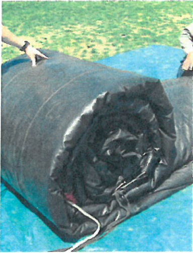
Step 9-10: Tuck in ports (blower tubes) and tie off roll.