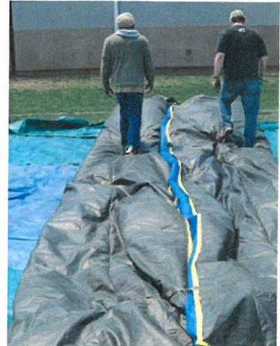
Step 2-6: Fold the Inflatable in 2-3 feet lengthwise and walk out air towards ports (blower tubes).