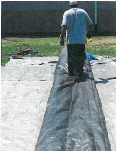
Step 2-6: Fold the Inflatable in 2-3 feet lengthwise and walk out air towards ports (blower tubes).