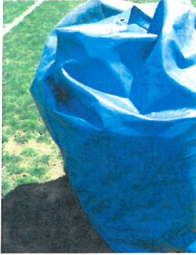
Step 9-10: Place in bag while Inflatable is standing.